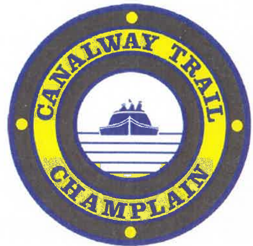
Champlain Canalway Trail 2018 Action Plan

Learn more at Parks & Trails New York : Bike Friendly New York ( ptny.org ).